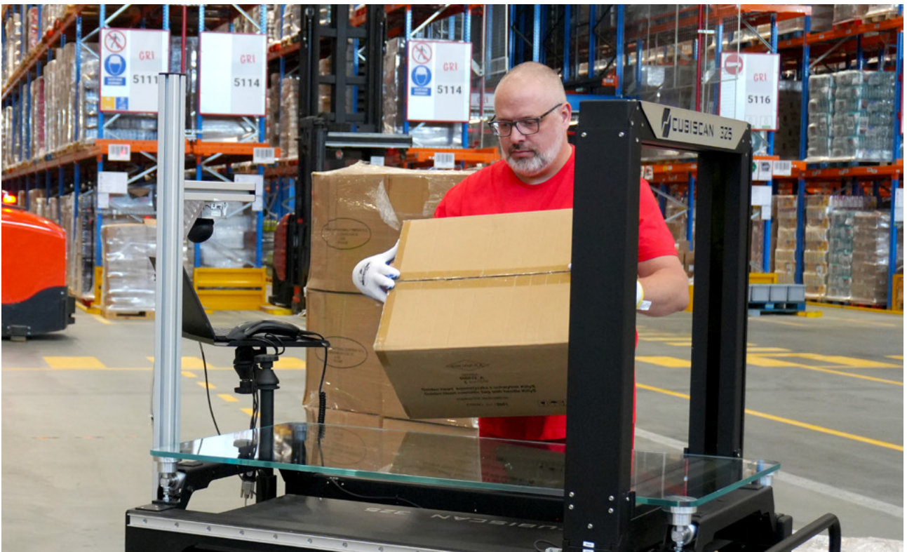
Placing the measured package on the glass platform.