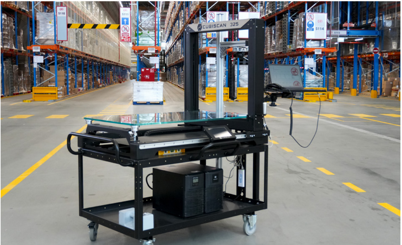
The Cubiscan 325 device ready for operation.